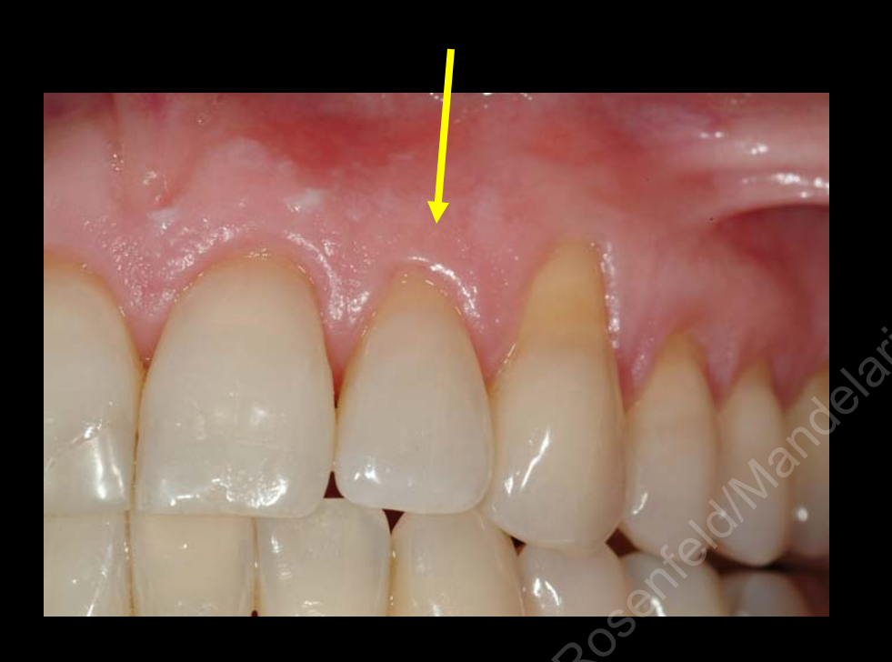
Initial Presentation: Advanced Root Resorption #10 (yellow arrow)